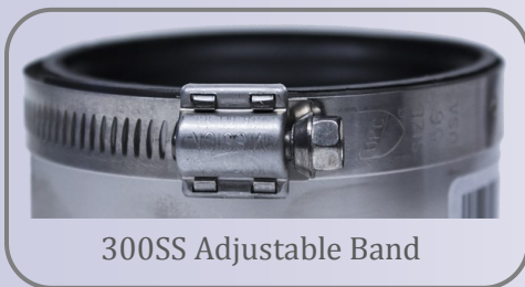
300SS Adjustable Band

For above ground installation where Cast Iron, XH Cast Iron, Plastic, Steel and Copper pipes are used.